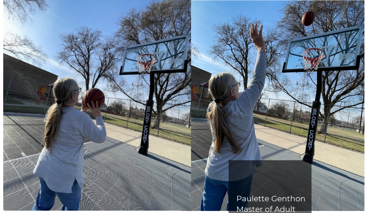
Take the Shot© Blaze 2024